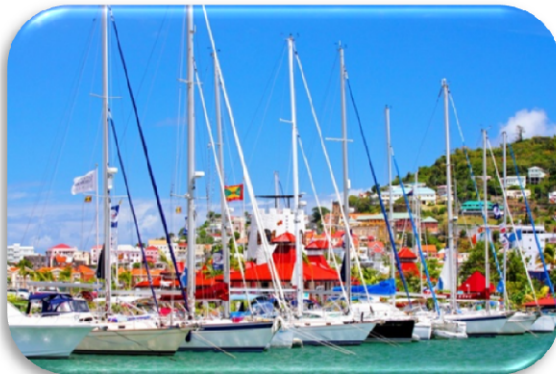
Yachts & 'Pocket' Cruises