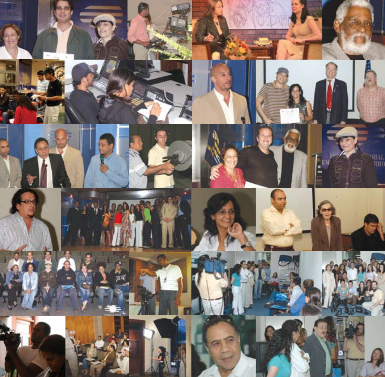
Professional Training . Dominican Republic